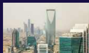
Saudi Arabia Tel: +966 8008143819