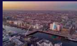
Ireland (Global) Tel: +353 16906550

With strategic offices in Europe, the Middle East, and Africa, Farrelly Mitchell is uniquely positioned to support public and private industry stakeholders at a global level. We understand that every agrifood project presents its own unique set of commercial, economic, and environmental challenges, and our global presence enables us to address these challenges effectively, taking regional and local contexts into careful consideration.